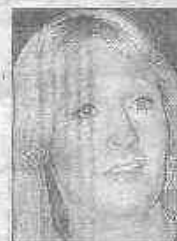
J.K. Rowling "Christian in her mode of living"